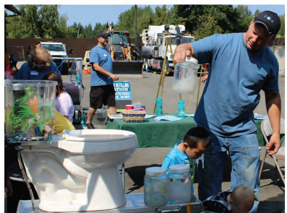
Where does the water go? Toilet Demo

We had over 50 raffle prizes THANKS to our local businesses including: Papa John's Pizza, 9- Round 30-Minute Kickbox Fitness Center, 5-Star Nail Salon, East Highlands Fitness Center, Ted's Family Meats, Bartell Drugs, Taco Time Northwest, Starbucks Cedar River Station, Carl's Jr., Cedar River Espresso, Crossco Coffee Company, Doofers Bar & Grill, and Sing Tong Thai Cuisine.