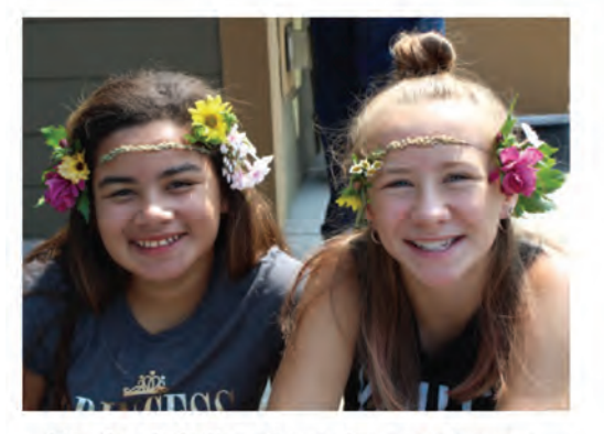
Two lovely ladies who made nature crowns