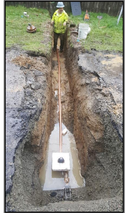
Water Service Line Connection along Lake Kathleen Road SE